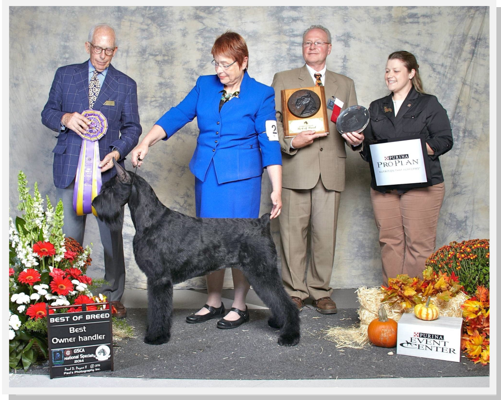
GCH Momentum Stars and Bright Lights TD