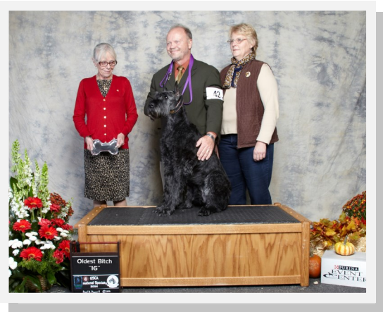
Pictured Above: Rustlers Tumbling Tumbleweed. "TUMBLEY"

Please send suggestions and photos to editor. Deadline for submission is BEFORE the 10th of each month.